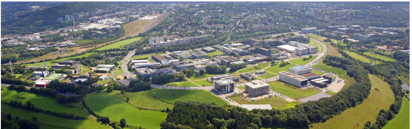
Picture 2: Competences and hardware along the entire SMC process chain are represented at the RWTH Aachen Campus.