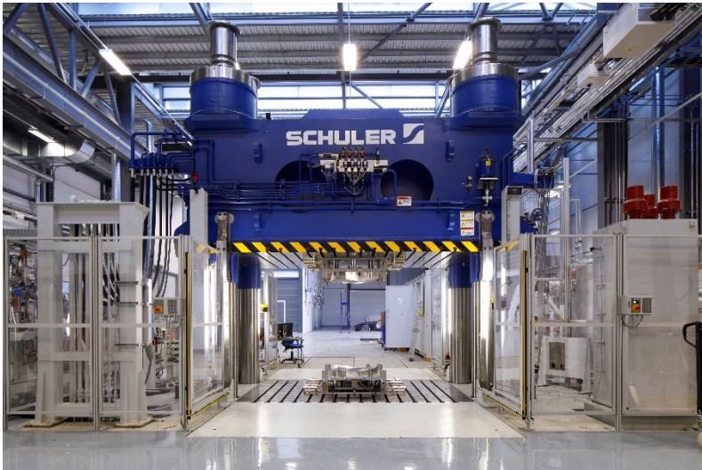
Picture 3: Large-scale industrial manufacturing equipment for SMC is also available in AZL's new research facility at RWTH Aachen Campus.